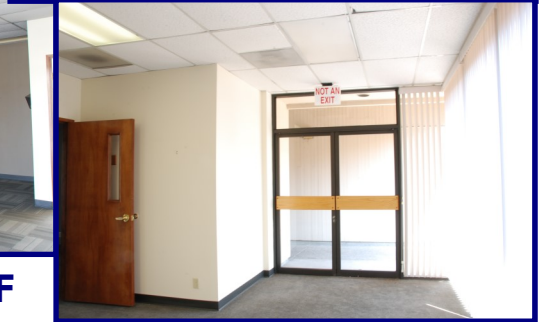
Suite 1215—1,220 SF